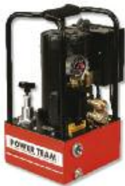
PE30TWP Torque Wrench Applications See page 174