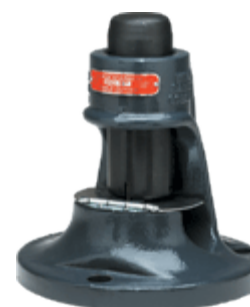
Model 1A 1 1/16" capacity