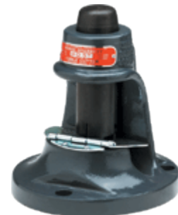
Model 2 1 1/2" capacity